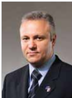
Mladjan Dinkic Deputy Prime Minister and Minister of Economy and Regional Development

“We have been dedicating our efforts for nine years to improve the business environment and enhance the overall investment climate in Serbia. We have recognized the need for an appropriate set of laws and an efficient and stimulating tax environment not only to support existing businesses, but also to attract new ones. Since 2000, dozens of new laws have been adopted, making Serbia a proud leader in business reforms, as reported by the World Bank’s Doing Business 2006.